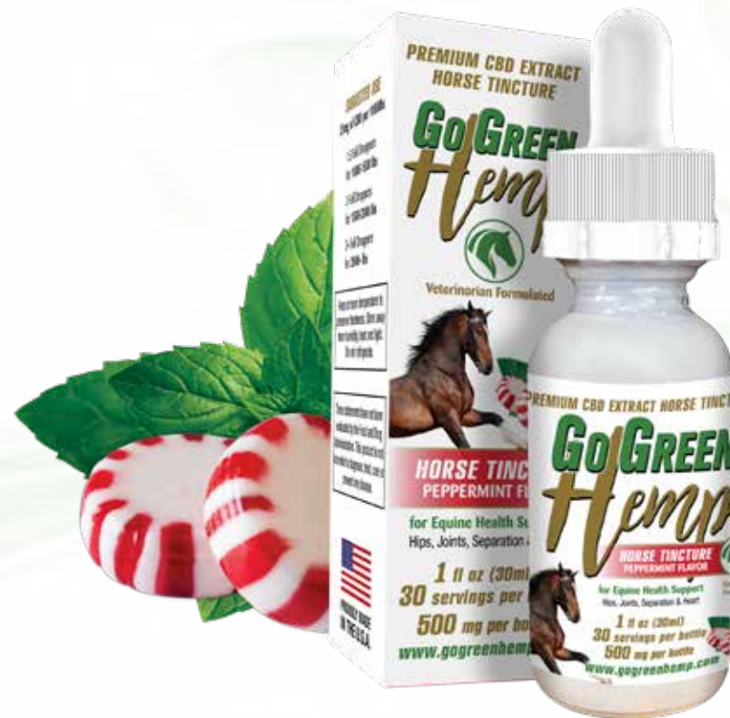
CHILD RESISTANT PACKAGING